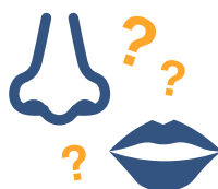
LOSS OF TASTE/SMELL